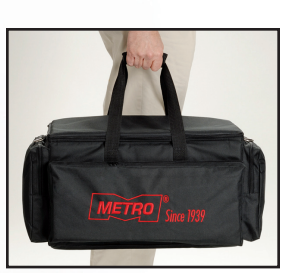
DataVac<sup>®</sup> ballistic nylon carry bag holds and protects all system components for safe, easy transport.