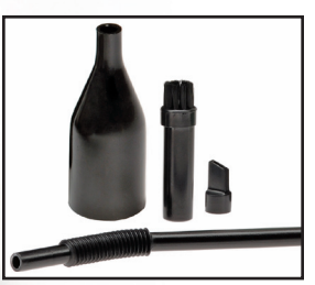
Micro Tool Kit cleans minute particles of dust and debris from hard-to-reach places.